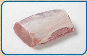
New York Roast