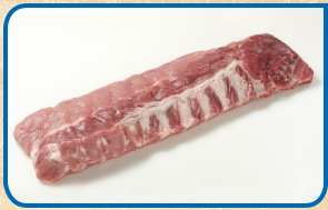
Loin Back Ribs