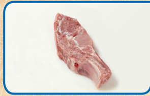
Loin Country-Style Ribs; bone-in