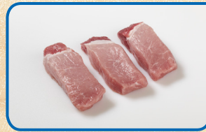
Loin Country Style Ribs; boneless