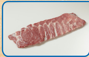
St. Louis-Style Ribs

For recipe ideas visit: www.PorkBeInspired.com